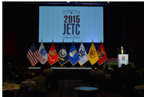
The main stage of the conference.