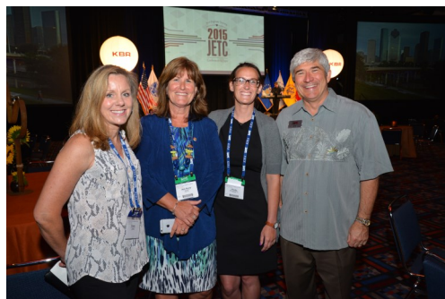
Bumping into some old (and new) friends from the Robins SAME Post.